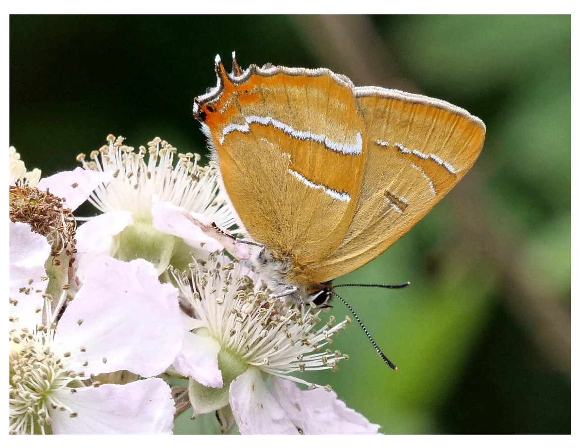
Brown Hairstreak