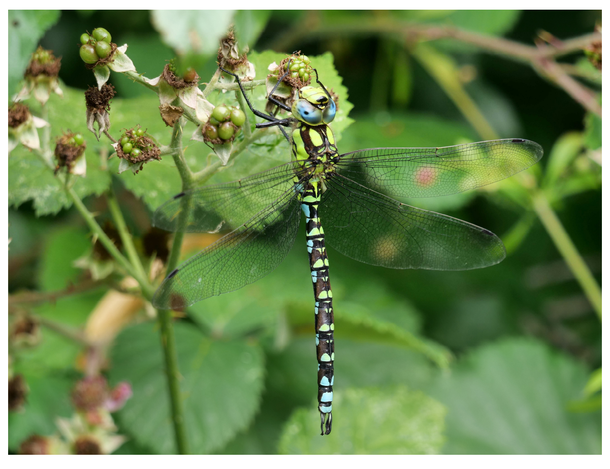
Southern Hawker by Gerry Traves