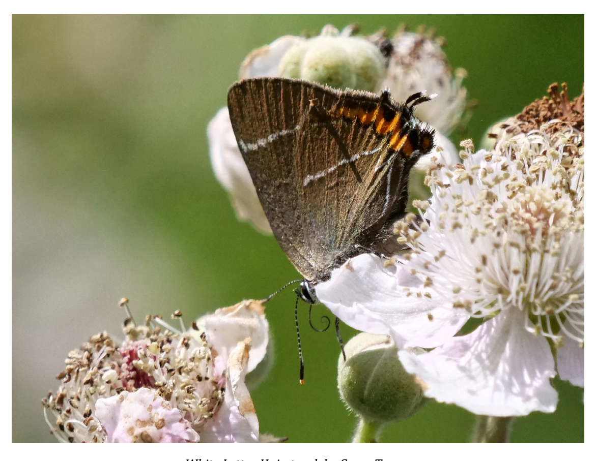
White Letter Hairstreak by Gerry Traves