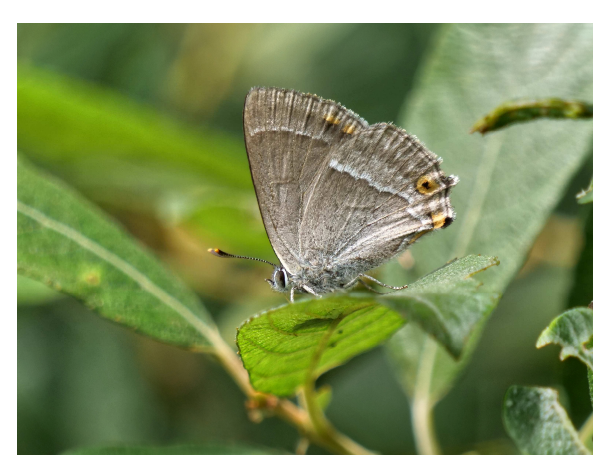
Purple Hairstreak by Gerry Traves