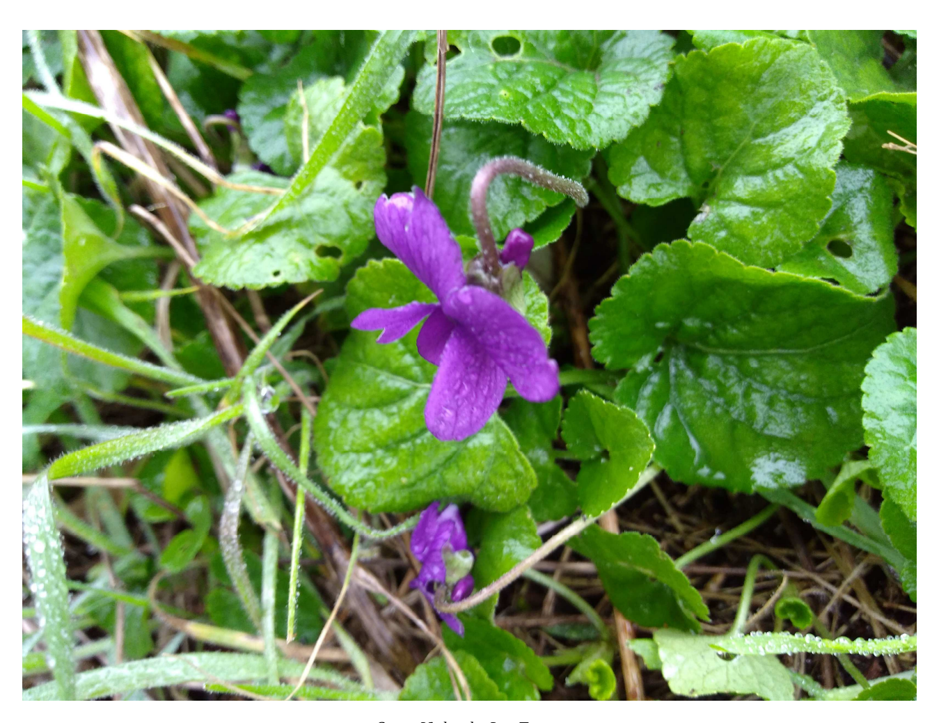
Sweet Violets by Lyn Traves