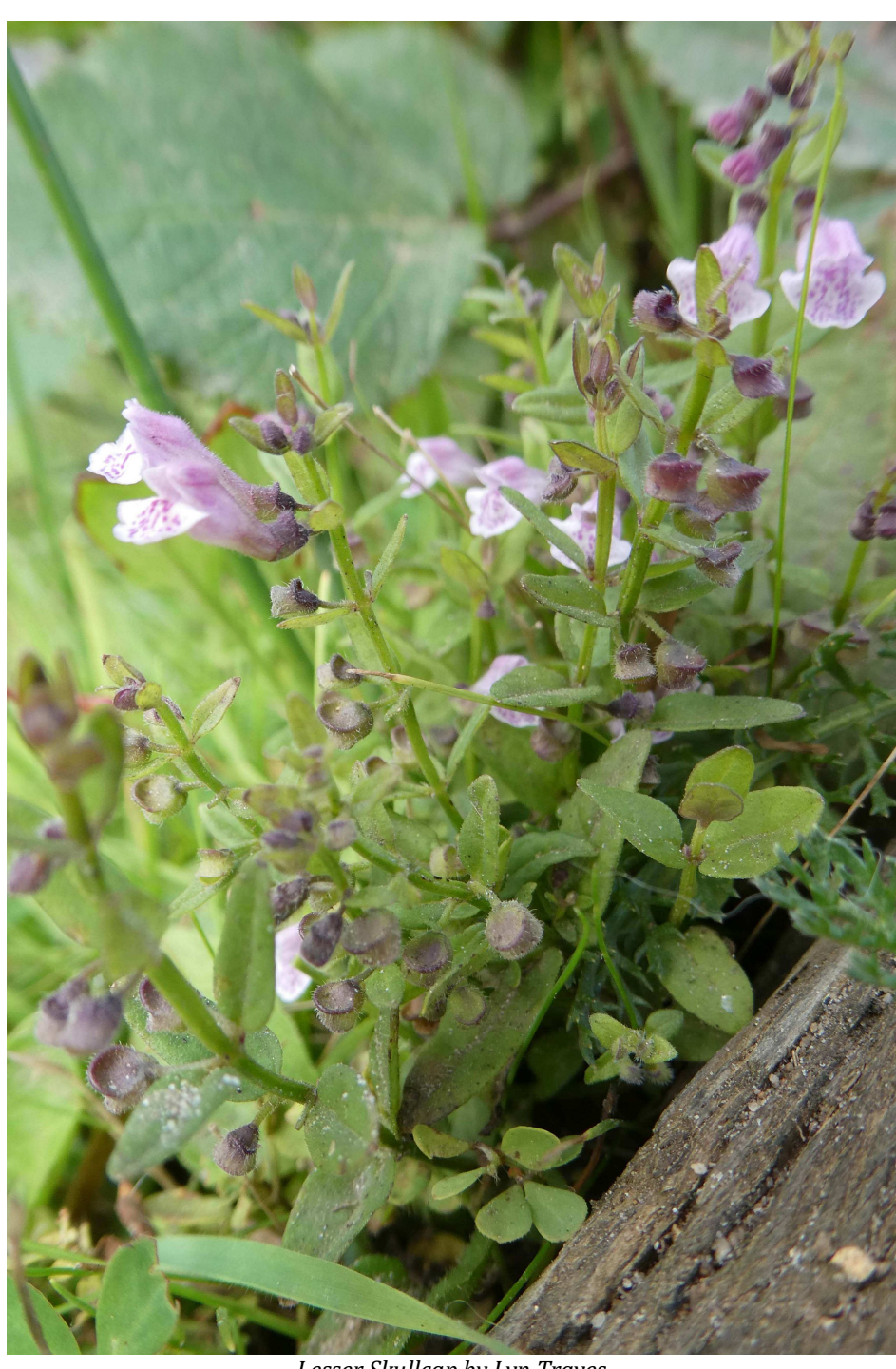
Lesser Skullcap by Lyn Traves