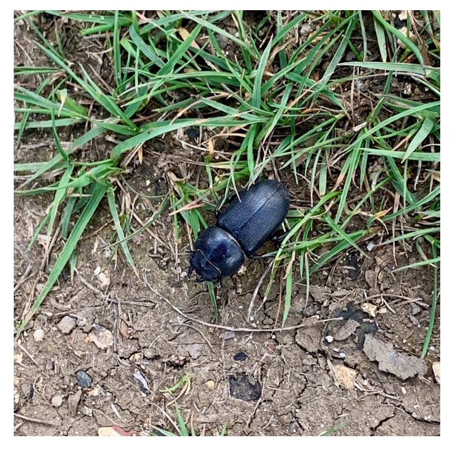
Lesser Stag Beetle (Dorcus parallelipipedus) by Martin King