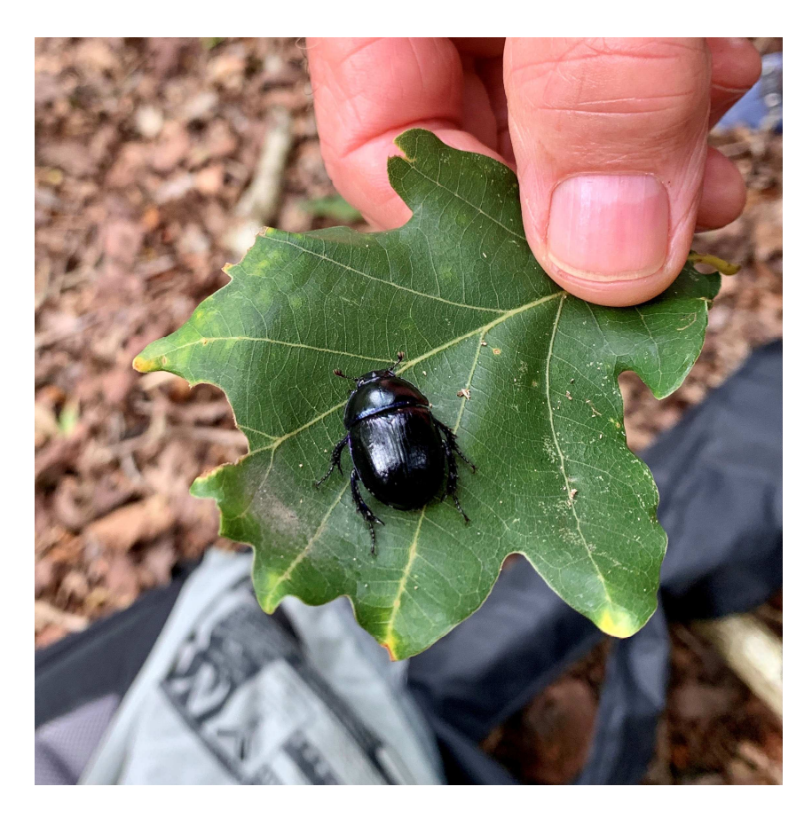
Dor Beetle (Geotrupes stercorosus) by Martin King