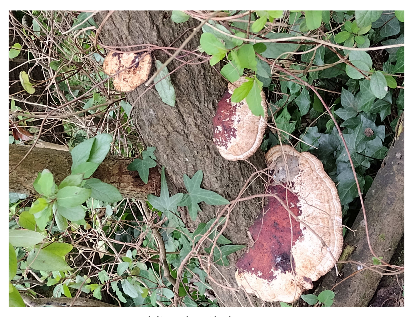
Blushing Bracket at Bickton by Lyn Traves