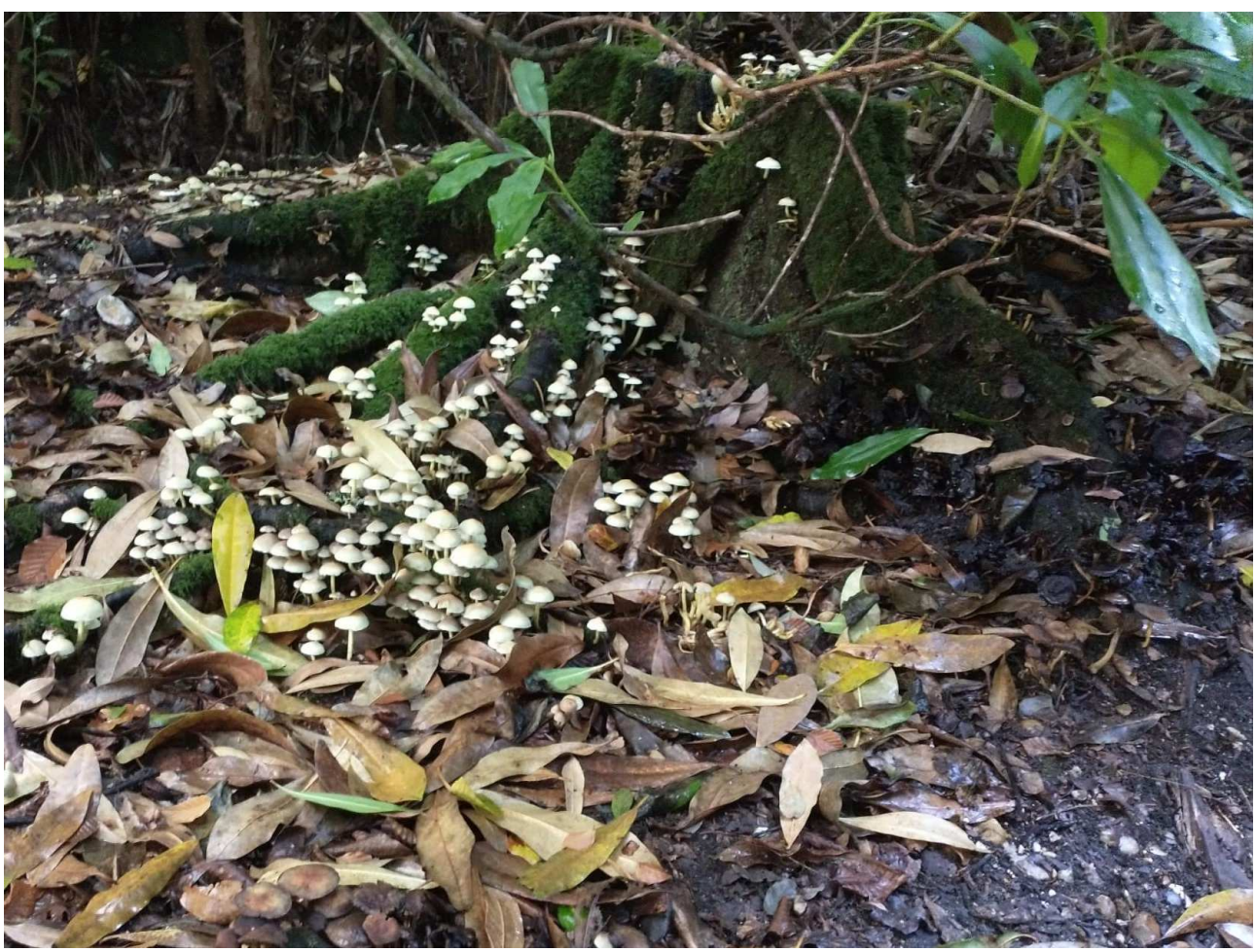
Hale and Woodgreen