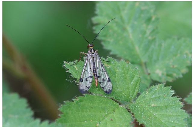
Scorpion Fly by Gerry Traves