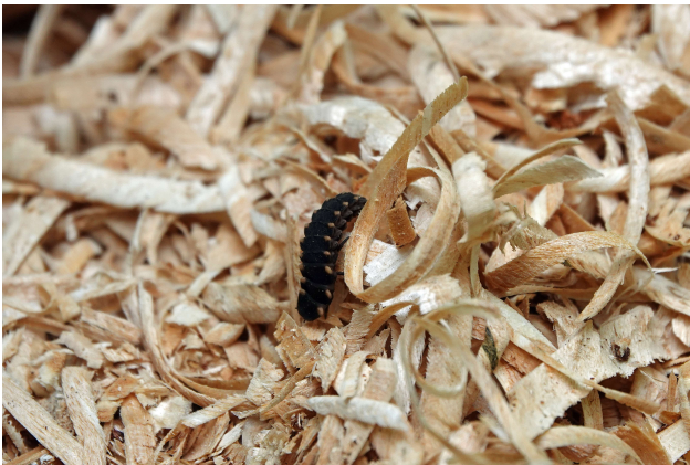
Glow-worm Larva by Gerry Traves