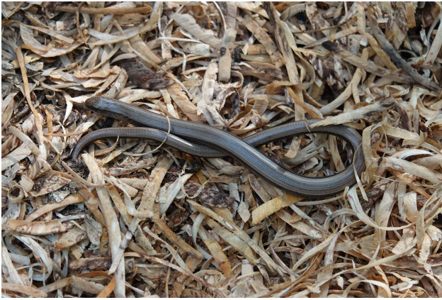
Slow Worm by Gerry Traves