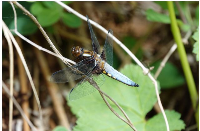
Broad Bodied Chaser by Gerry Traves