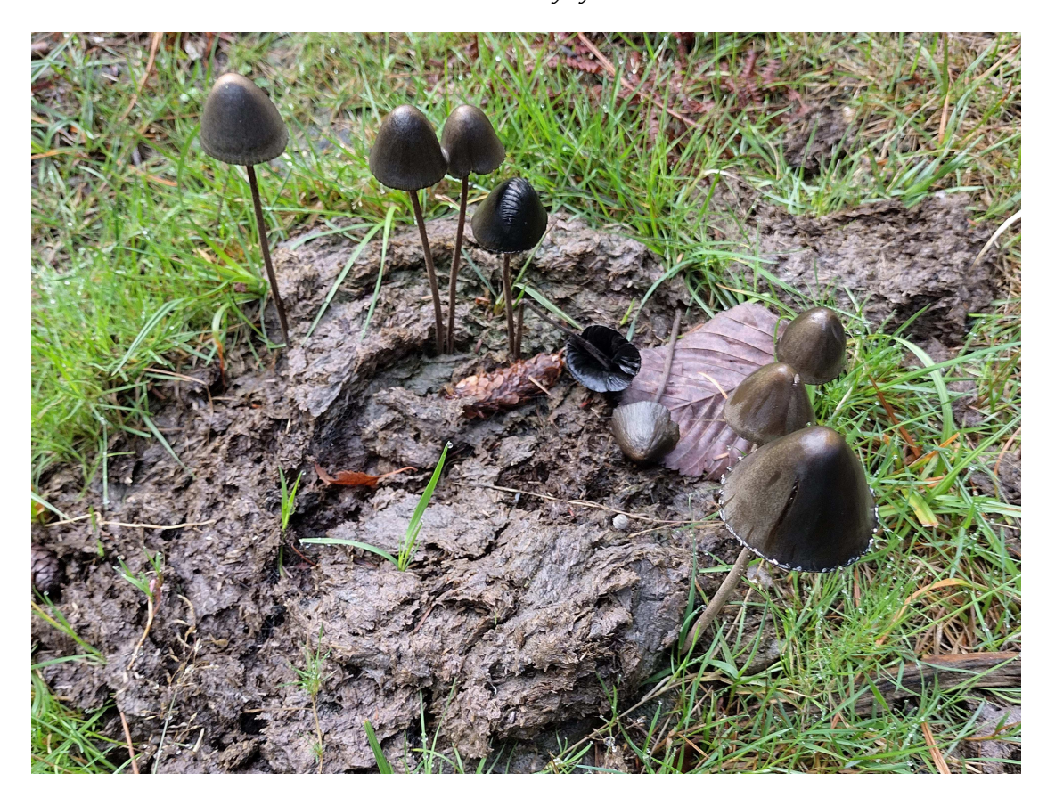
Petticoat Mottlegill by Lyn Traves