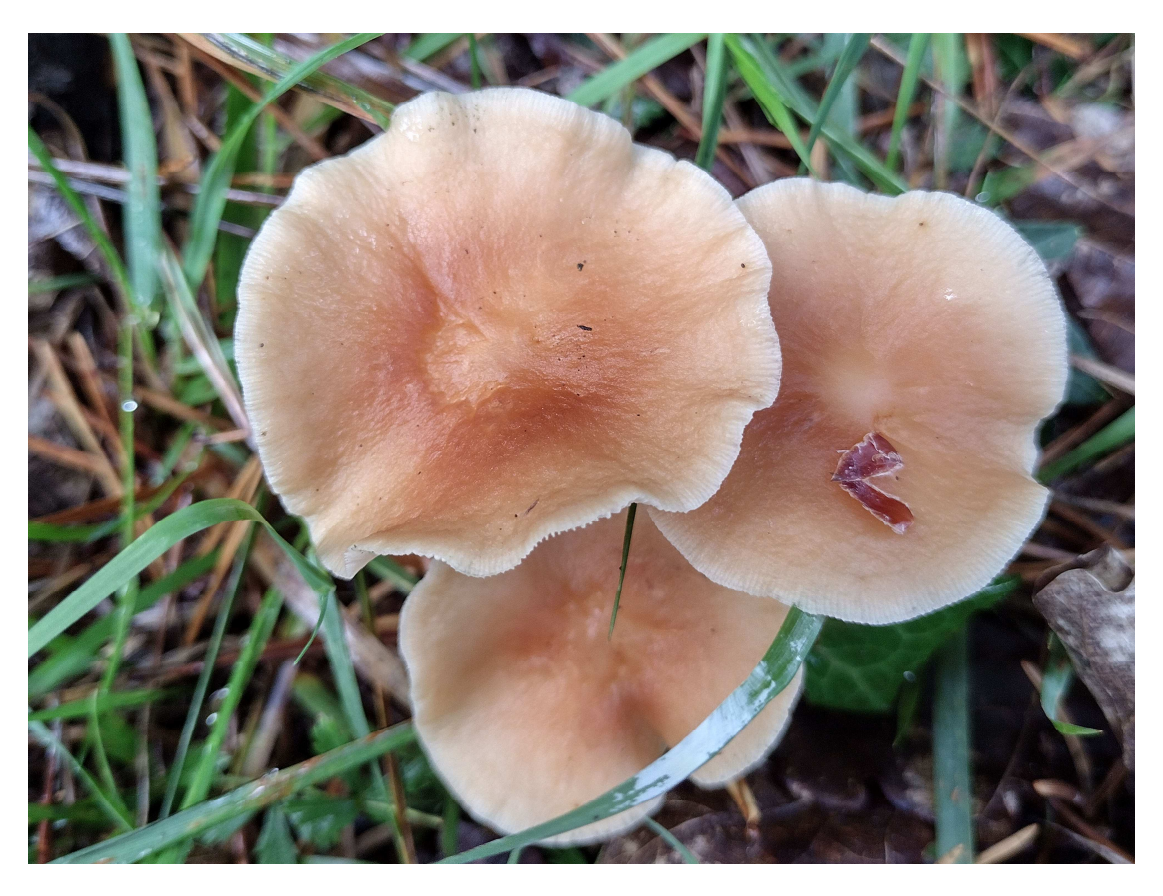
Common Funnel by Lyn Traves