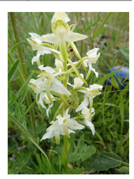
Greater Butterfly Orchid by Lyn Traves