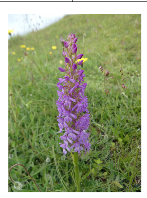
Fragrant Orchid by Lyn Traves