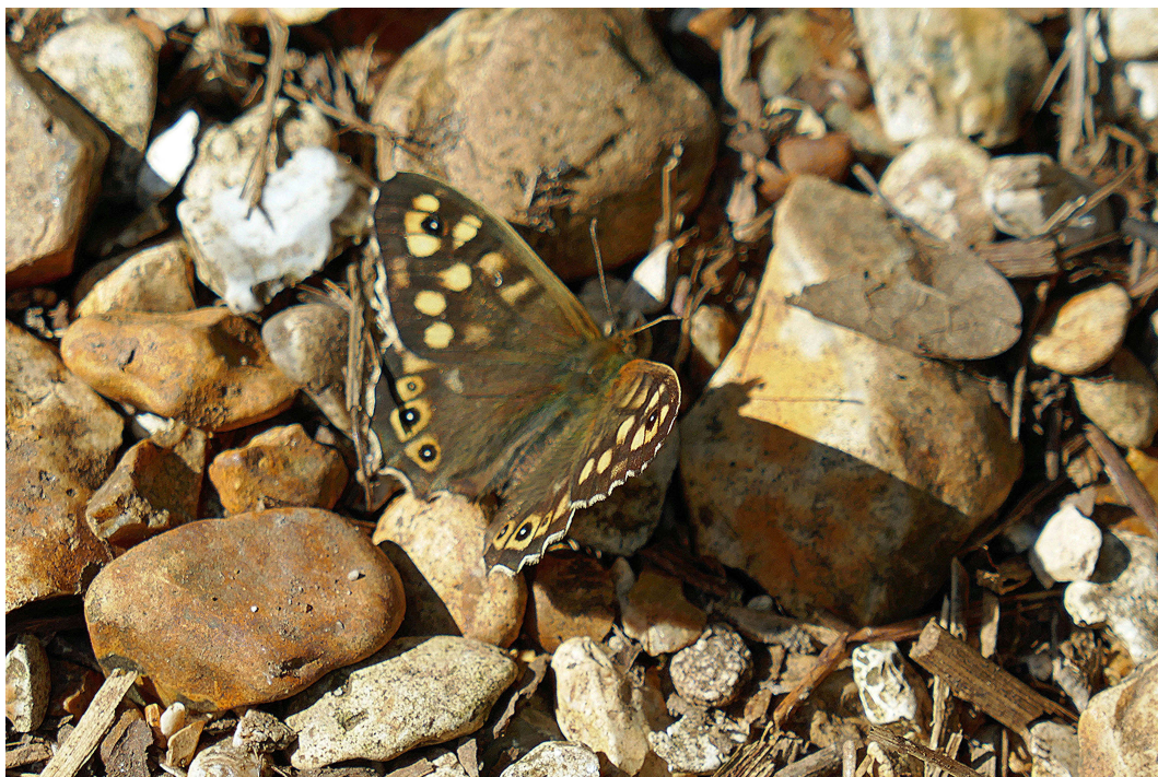
Speckled Wood Butterfly by Lyn Traves