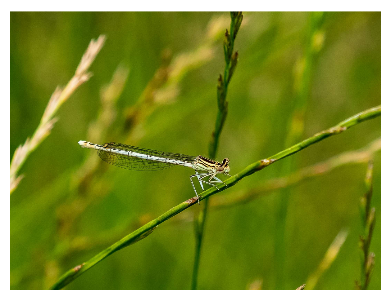
White-legged Damselfly (Platycnemis pennipes) By Martin King