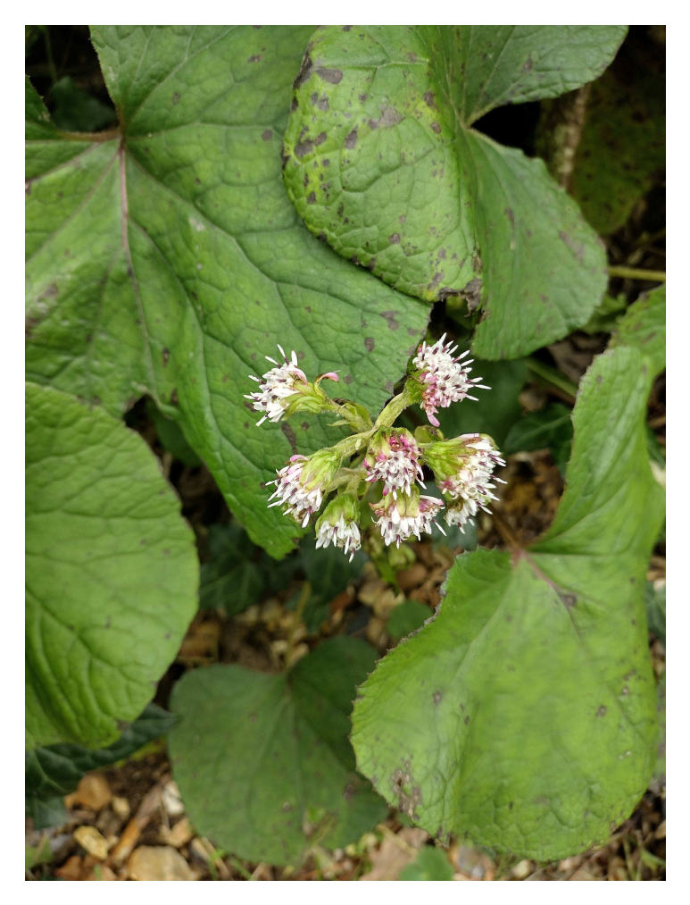
Winter Heliotrope at Stanpit by Lyn Traves