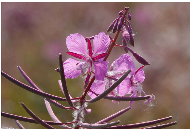
Rosebay Willowherb