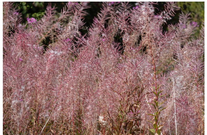
Rosebay Willowherb