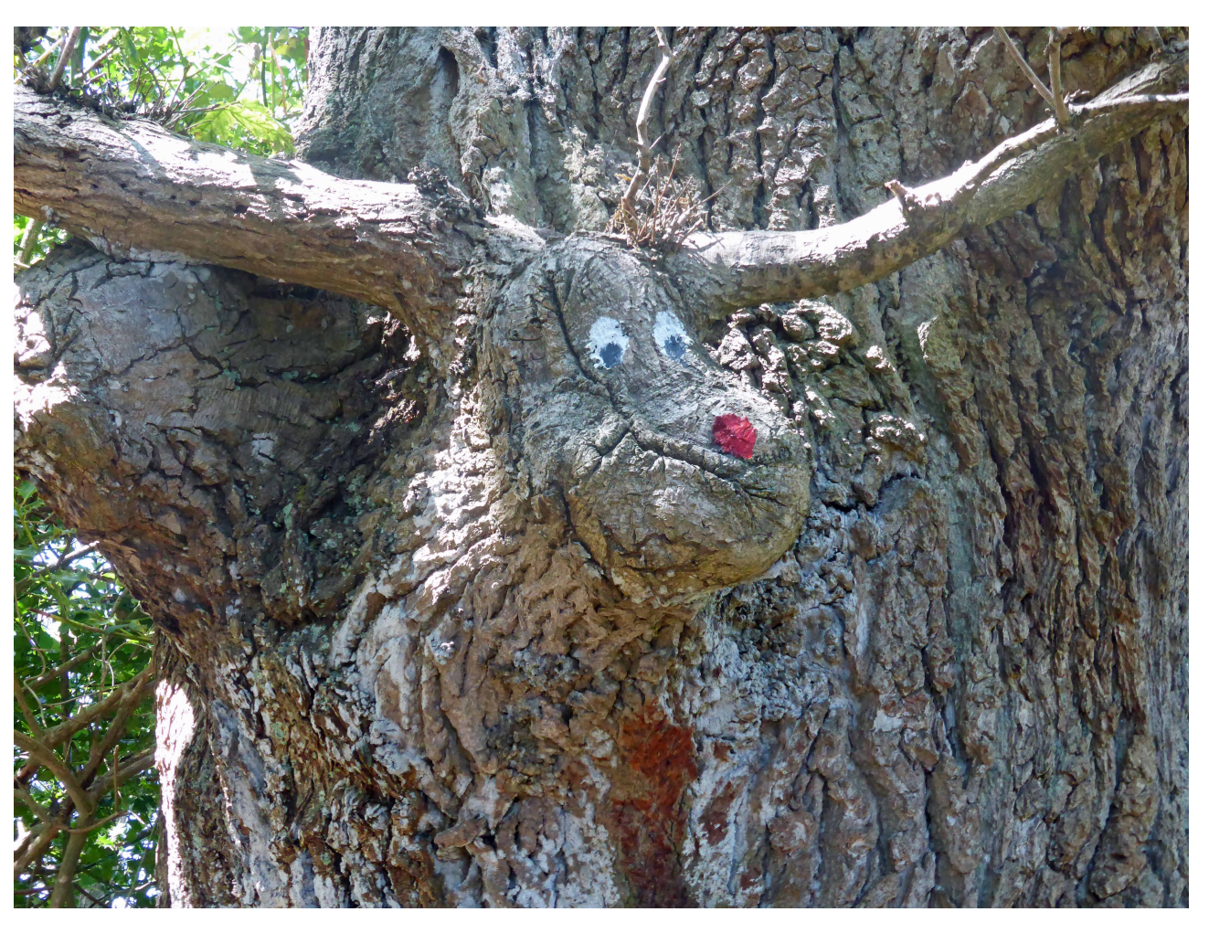
An unusual looking deer by Lyn Traves