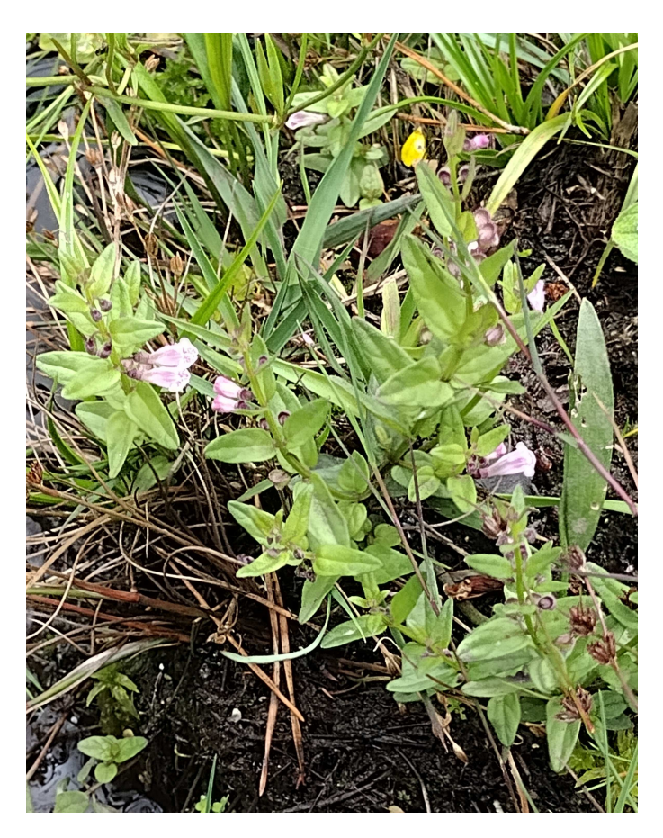
Lesser Skullcap at Ober Water by Lyn Traves