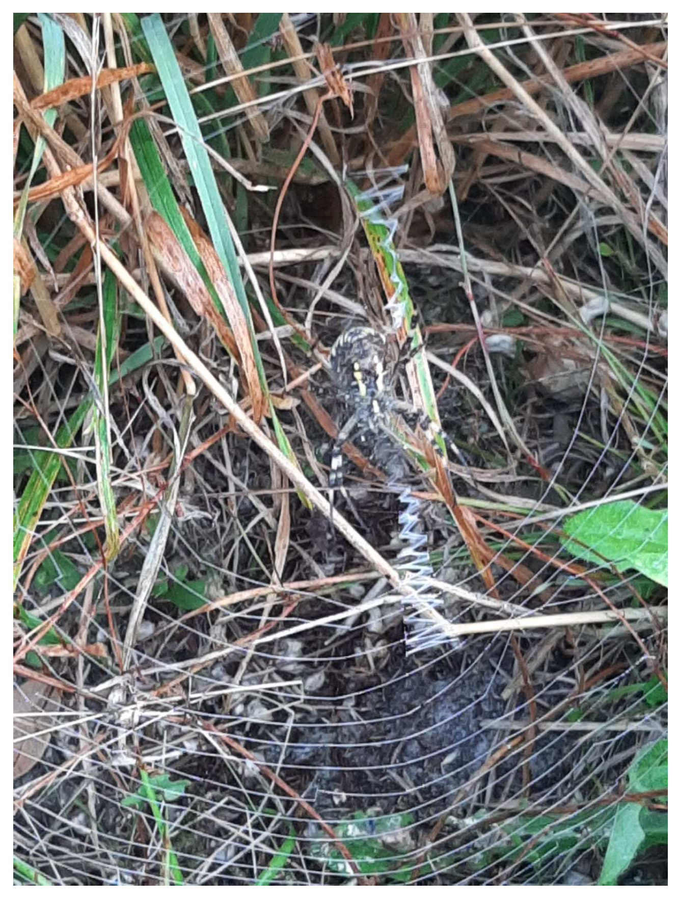
Female Wasp Spider showing the stabilimentum on her web by Jane O'Reilly