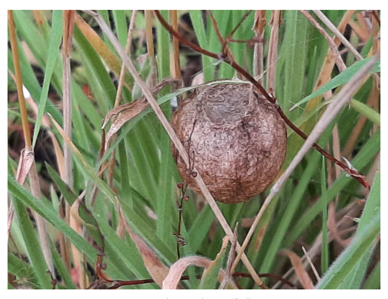
Wasp Spider egg sac